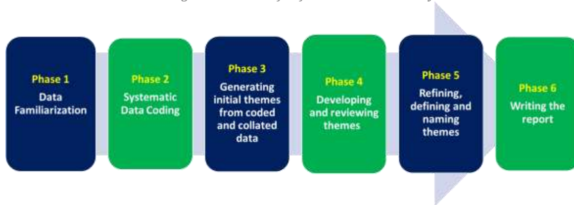
Figure 2: Phases of Reflexive Thematic Analysis

Researchers in the ambit of qualitative study designs, have proposed four main criterions for the aforementioned purpose: credibility, transferability, dependability, confirmability. To ensure trustworthiness and rigor all of these criterions were incorporated in the light of the guidelines of Lincoln and Guba (1985). An accessible and theoretically malleable method for analyzing qualitative data, reflexive thematic analysis allows researchers to quickly and easily isolate and examine overarching patterns and themes within a collection of data (Braun and Clarke 2012). Diagrammatic illustration is given in Figure 2.